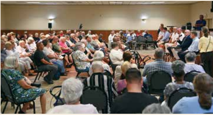
Photographer: Erie Caldwell, Sandusky Register. Used with permission.